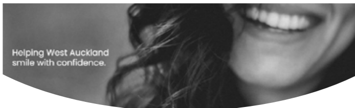
Helping West Auckland smile with confidence.