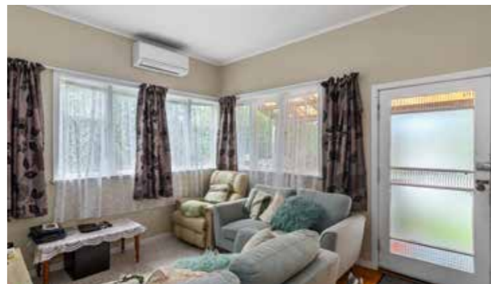
2 Riverpark Crescent, Henderson